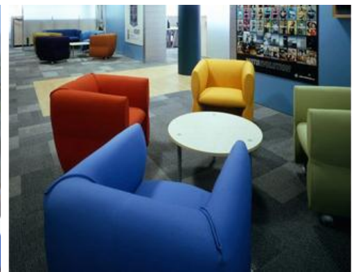
break out area